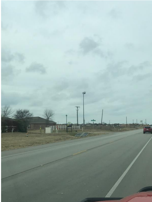
Hwy. 5 at Meadowview