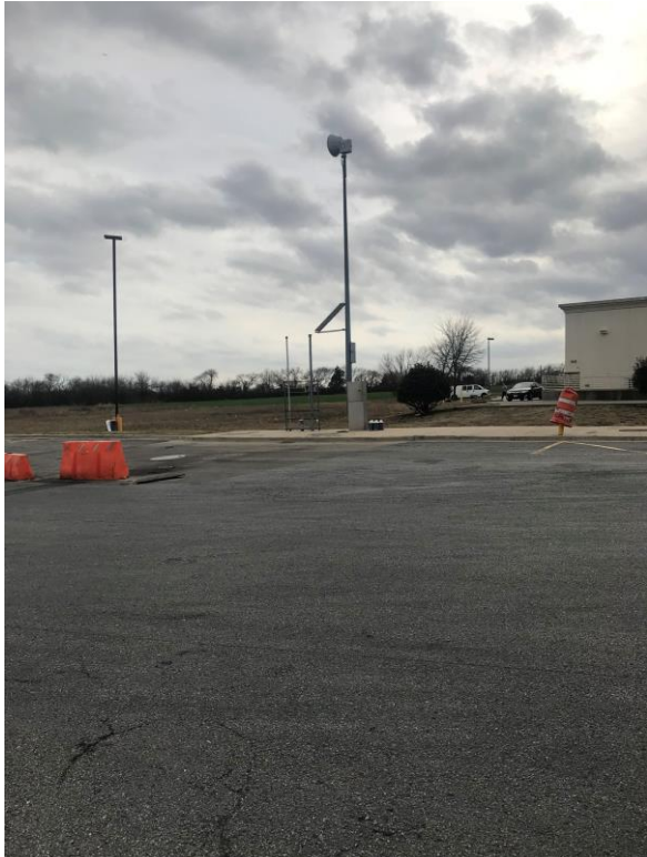
Hwy. 75 & FM 455 (Next to Loves)